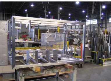
YOUR PRECISION NEEDS