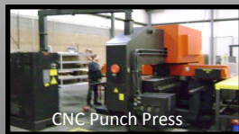
CNC Punch Press