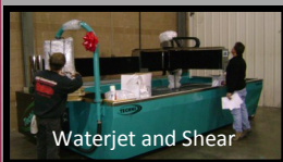
Waterjet and Shear

Keystone Fabricating is a precision custom metal fabricator in business since 1979. We are capable of working with nearly all types of metals including: stainless steel, mild steel, aluminum, titanium, Inconel, monel and hastelloy. Keystone Fabricating is a one stop shop with the capability to manufacture anything from prototypes to long production runs. Our current customers include; electrical, pharmaceutical, computer, food service and government contractors among others.