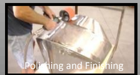
Polishing and Finishing